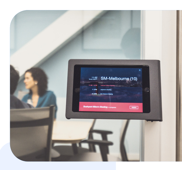
Scheduling Display provides room status and booking capabilities.

Make interactive collaboration easy with touch screen displays.